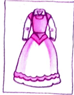
lavish very grand