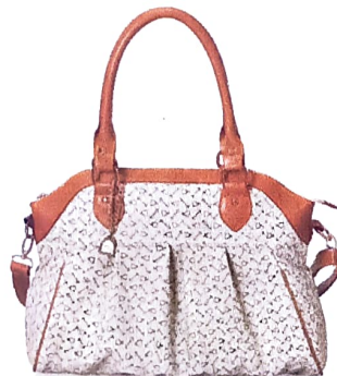
A n—w bag.