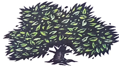
A short tree