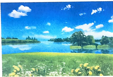
A bri ght day