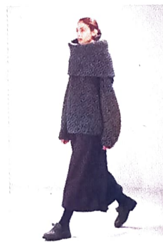
An —gl— dress.