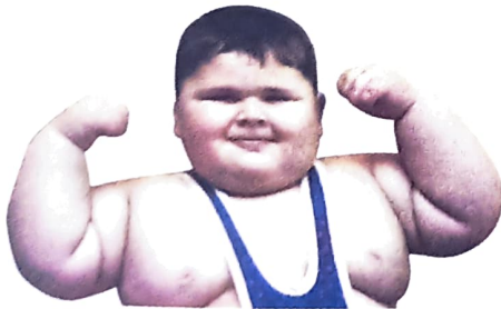
A fat boy