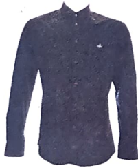
A black shirt