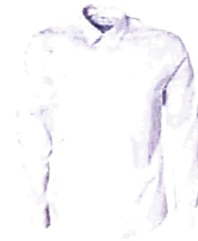
A white shirt