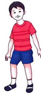
A slim boy