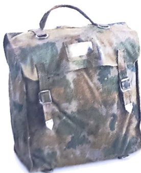
An old bag