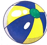
A small ball