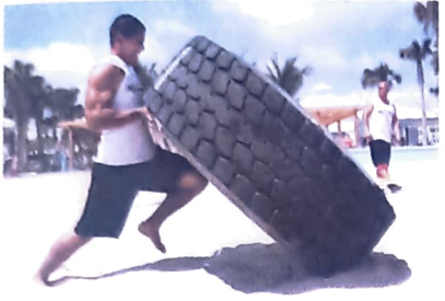
A s-ro-g man