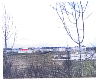
A d—ll day.