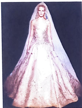
A beautif ul dress