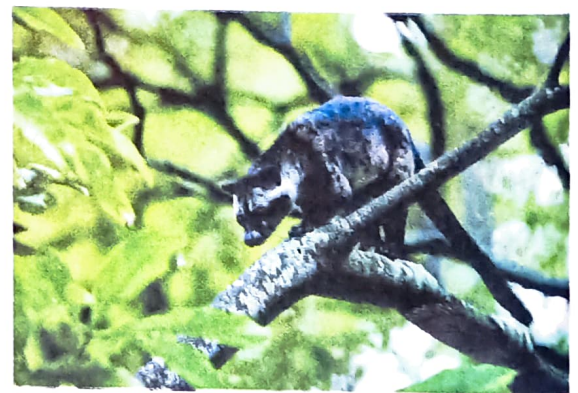
Asian palm civet