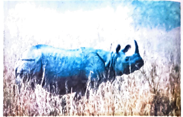
Great Indian one horned rhinoceros

Sagar : Oh! You don't know. It is not very far from Guwahati. It is situated in the Morigaon district. It is about 48 kilometres by road from Guwahati. It is located towards the east of Guwahati. If we take a car it will only take about an hour to reach there.