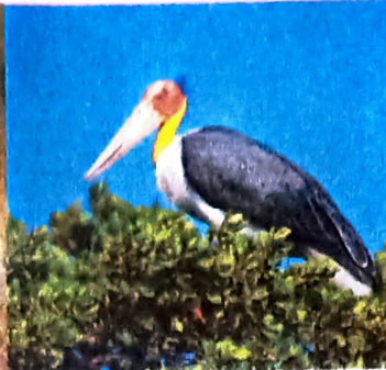
Lesser adjutant stork